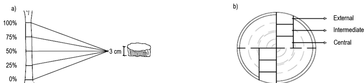
Fig. 2 Sampling tree scheme for the study of physical properties of wood (a), sampling scheme of base disc for analysis of physical properties of wood (b)

were dried in an oven with air circulation at 105\pm 2^{\circ}\text{C} until constant mass was achieved; the dry weight of each sample and the basic density were then determined.