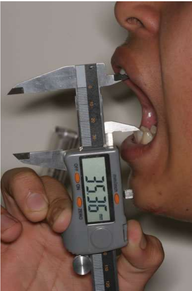
Fig. 10 The 30-day postoperative maximum interincisal opening.