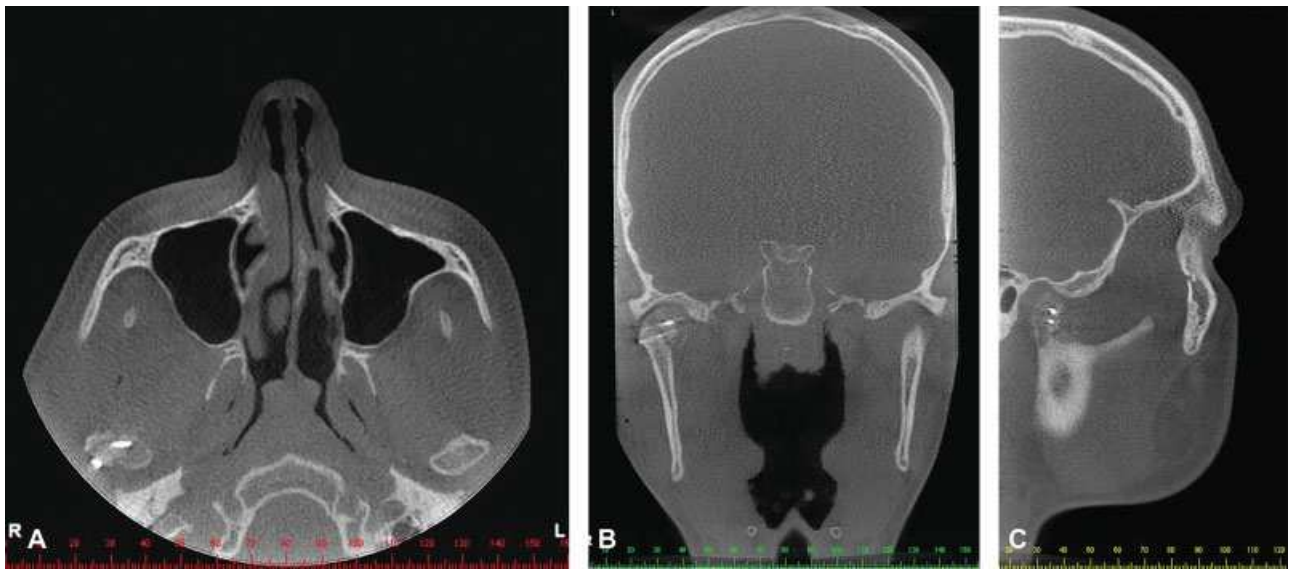
Fig. 8 (A) Postoperative axial CBCT scan showing the reduction of the medial displaced bone segment. (B) Postoperative coronal CBCT scan showing the reestablishment of the mandibular height, with the reduction of the fractured segment. (C) Postoperative sagittal CBCT scan showing proper alignment of the condylar fracture.

out an ultimate consensus. 6,13 In 2014, the AOCMF (Arbeitsgemeinschaft für Osteosynthesefragen CranioMaxillofacial) level 3 classification system for condylar process fractures was proposed. It is expected that with a protocol on the diagnosis process, a more accurate evaluation of the condylar process fractures will be better understood and compared among