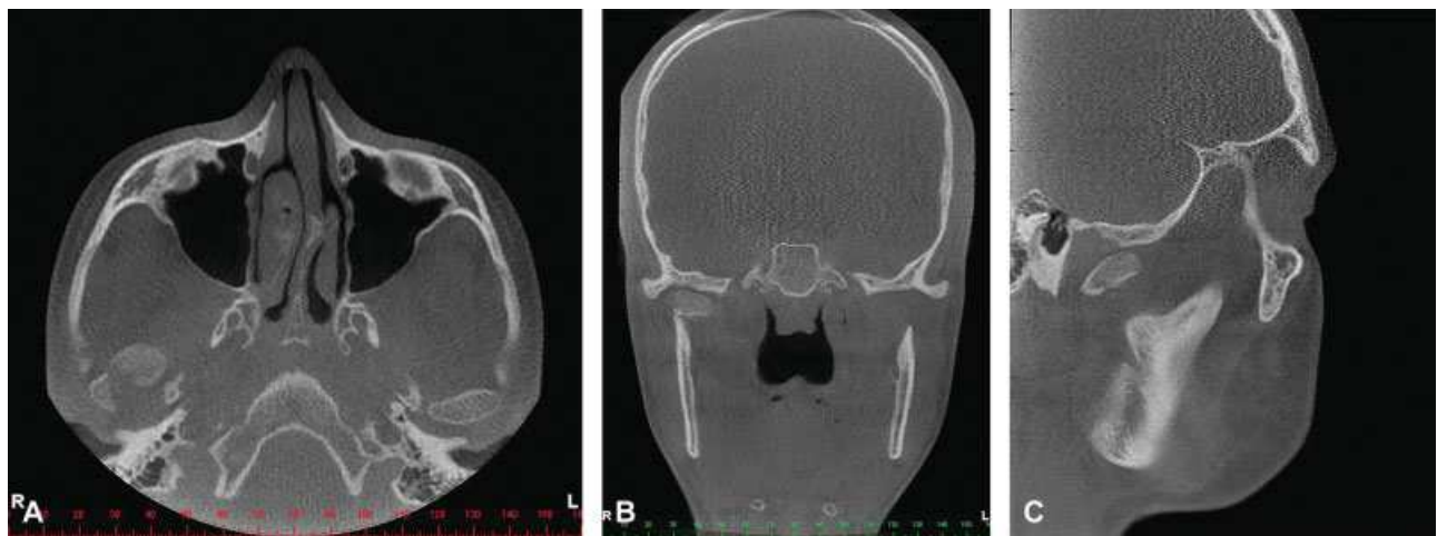
Fig. 4 (A) Preoperative axial CBCT (Cone Beam Computed Tomography) scan showing the medial displacement and the sagittal fracture of the condylar head. (B) Preoperative coronal CBCT scan showing the condylar head fracture. (C) Preoperative sagittal CBCT scan showing the displacement of the condylar head.

The immediate postoperative tomographic image confirmed the adequate reduction and fixation of the fractured segment (→ Fig. 8A-C ). The patient was kept in mild postoperative physical therapy during the first postoperative weeks. During the 30-day postoperative follow-up, the