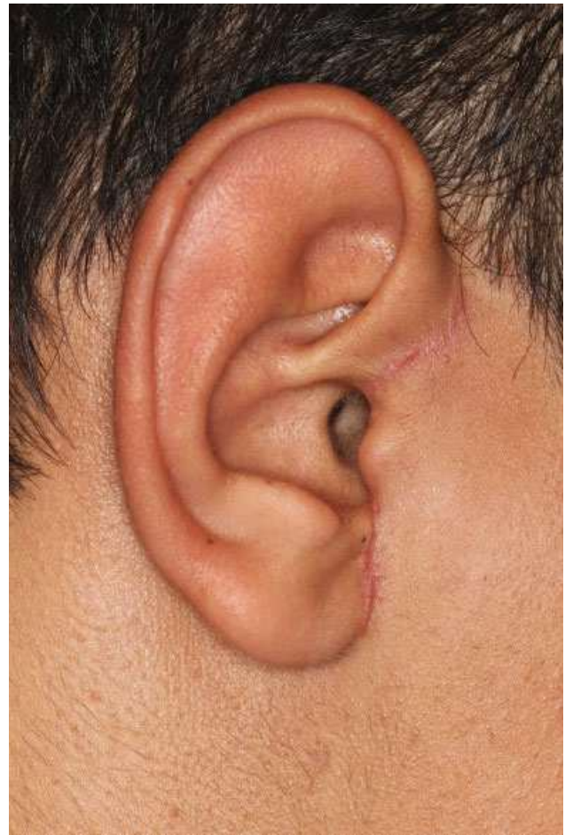
Fig. 12 Good aesthetic results with 30 days after surgery for the preauricular approach.

different centers and studies published. 14 The decision for the surgical treatment of condylar fractures should be based on factors, such as the patient's individual profile (systemic, dental, and psychosocial factors), functional limitation (mastication, mouth opening, and malocclusion), concomitant fractures (e.g., associated mandibular or middle-third fractures), where it is necessary to reestablish a reliable reference, such as the posterior facial height and the degree of condylar displacement. 2,4-6 Conservative treatment is still widely used for condylar frac-