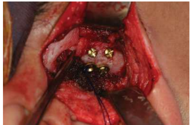
Fig. 6 Capture and reduction of the articular disc to its anatomical position.

this fixation method is because there is usually no sufficient space to reduce and stabilize the bone fragment using plates and screws, in this type of fracture. One important maneuver to aid in the capture and reduction of the fractured bone fragment is the mandibular downward traction, which increases the available space in the articular cavity. This maneuver can be performed using a screw in the mandibular ramus, more inferiorly, near the region of the mandible angle and with a steel wire attached to it, so as to draw the mandible downward (→ Fig. 5 ). After the reduction of the medially dislocated bone fragment, it was stabilized using 2 12 mm screws according to the lag screw technique. This procedure approximated the performed bone reduction, stabilizing the fractured segment. After the reduction and fixation of the condylar head fracture, the articular disc was repositioned back to its anatomical position and stabilized with a Prolene 2.0 suture (Ethicon, Johnson and Johnson, USA) attached to a mini-plate installed onto the mandibular posterior ramus region (→ Figs. 6 and 7 ). This technique allowed the disc to be stabilized and held anatomically in a satisfactory way.