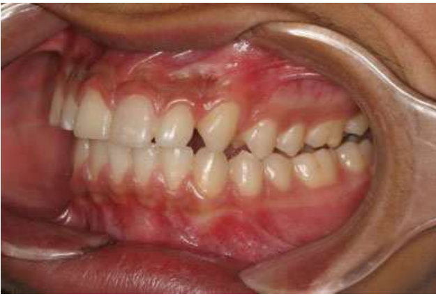
Fig. 3 Left side of the occlusion with a slight open bite as a consequence of the reduction or the height of the mandibular ramus on the right side.