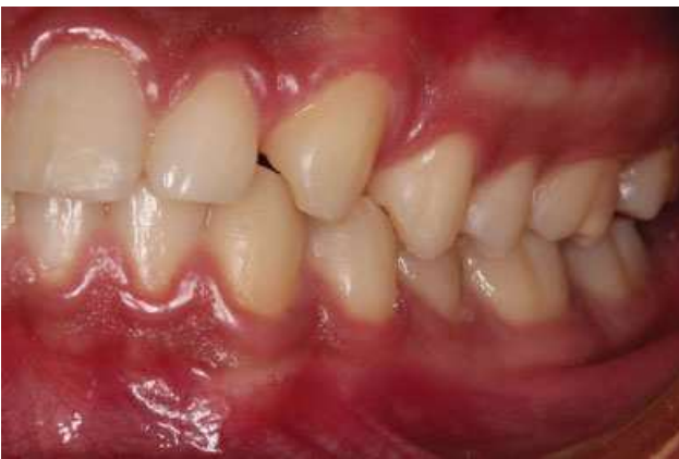
Fig. 11 Left occlusion reestablished after surgery.

different centers and studies published. 14 The decision for the surgical treatment of condylar fractures should be based on factors, such as the patient's individual profile (systemic, dental, and psychosocial factors), functional limitation (mastication, mouth opening, and malocclusion), concomitant fractures (e.g., associated mandibular or middle-third fractures), where it is necessary to reestablish a reliable reference, such as the posterior facial height and the degree of condylar displacement. 2,4-6 Conservative treatment is still widely used for condylar frac-