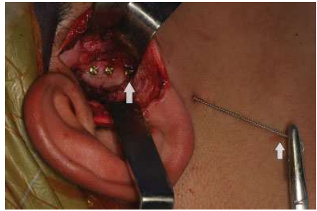
Fig. 5 Mandibular downward traction with a screw and steel wire. White arrows show the proposed AO/ASIF maneuver.

this fixation method is because there is usually no sufficient space to reduce and stabilize the bone fragment using plates and screws, in this type of fracture. One important maneuver to aid in the capture and reduction of the fractured bone fragment is the mandibular downward traction, which increases the available space in the articular cavity. This maneuver can be performed using a screw in the mandibular ramus, more inferiorly, near the region of the mandible angle and with a steel wire attached to it, so as to draw the mandible downward (→ Fig. 5 ). After the reduction of the medially dislocated bone fragment, it was stabilized using 2 12 mm screws according to the lag screw technique. This procedure approximated the performed bone reduction, stabilizing the fractured segment. After the reduction and fixation of the condylar head fracture, the articular disc was repositioned back to its anatomical position and stabilized with a Prolene 2.0 suture (Ethicon, Johnson and Johnson, USA) attached to a mini-plate installed onto the mandibular posterior ramus region (→ Figs. 6 and 7 ). This technique allowed the disc to be stabilized and held anatomically in a satisfactory way.