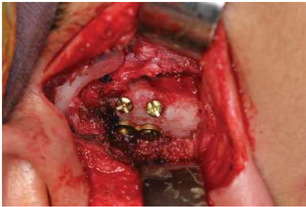
Fig. 7 Stabilization of the articular disc with a 2.0 Prolene suture in a 2 hole 1.5 mm plate.

patient did not report any painful symptomatology and showed improvement in symmetry and maximum mouth opening (►Figs. 9 and 10). The dental occlusion was functionally restored (►Fig. 11A, B) and the postoperative scar of the preauricular approach presented satisfactory aesthetics (►Fig. 12). Over the first postoperative weeks, the patient showed mild weakness of the facial nerve, which was normalized entirely later (►Fig. 13 A, B).