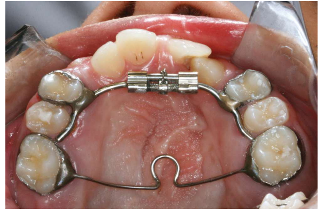
Figure 2 - Inverted mini-Hyrax expander.

The IMHX presented a jackscrew (Variety Expander, Dentaurem, Saint Ann, MO, USA) in the anterior region with arms that were bent posteriorly and soldered bilaterally to the first premolar bands. The extensions from the expander screw followed the palatal surface of the crowns of the first and second premolars and/or the first and second deciduous molars. A fixed transpalatal arch was connected the maxillary first molars to prevent posterior expansion, and stainless steel rods were welded on prior to appliance insertion to incorporate the canines into the expansion (Fig 2).