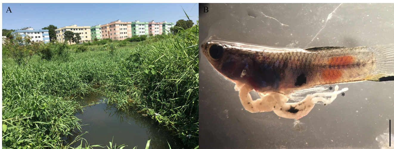
Figure 1. The finding of Poecilia reticulata infected with tapeworms in Brazil. A) Photo of the stream located in an urban area in Belo Horizonte, Minas Gerais State, where fish were found to be infected in April 2021; B) A fish specimen with two worms (indicated by asterisks) emerging from the intestine sectioned during necropsy. Scale bar: 3 mm.