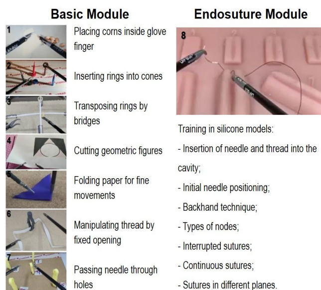
Figure 1. Exercises for training specific laparoscopic operative skills in dry-lab simulators. Basic Module: exercises 1 to 7; Endosuture Module: exercise 8, with 7 activities.

2020, maintaining all the precautions recommended for the prevention of COVID-19, such as social distancing, use of masks, and frequent cleaning with alcohol. These modules consisted of review of theoretical issues, demonstration of videos of operations and situations requiring certain laparoscopic skills, and application of new knowledge in training laparoscopic practice with dry Lab simulators. This stage of the program was based on simulation and proficiency, with individualized and progressive training (the resident only advanced to the next exercise after reaching the goal of the previous exercise), in addition to the presence of a tutor to assist the learner in time of need (Just In Time information) 12 . The face-to-face modules (Basic and Endosuture, sequentially) were composed of eight exercises for the development of laparoscopic skills and the practices were distributed over two days, allowing a large number of repetitions (Figure 1).