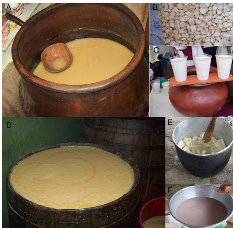
Fig. 1 – Chicha de jora (A); Morocho (white maize) (B); Chicha de morocho ready to drink (C); seven-grain chicha (D); cassava for chicha de yuca production (E); Chicha de yuca ready to drink after addition of seeds of the Ungurahua palm (F).

was expressed as the means of each morphotype in each sample in colony-forming units (cfu/mL). Representative colonies of each different yeast morphotype from both culture media were purified on YMA plates and preserved at -80^{\circ}\text{C} or in liquid nitrogen for subsequent identification.