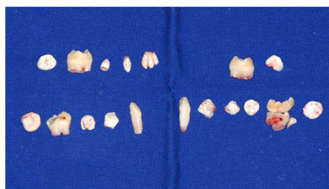
Figure 1: Clinical examination.

The aim of this paper was to present a case of Brazilian child girl with a record number of MST described in the scientific literature in our knowledge. All quadrants were stricken and fourteen supernumerary teeth and four wisdom teeth were removed surgically by general anesthesia. The presence of MST are rare in non-syndromic patients, especially when affect all mouth quadrants. The present study situation is extreme if compared with Gomes et al [5]. Which reported only nine supernumerary teeth in your study.