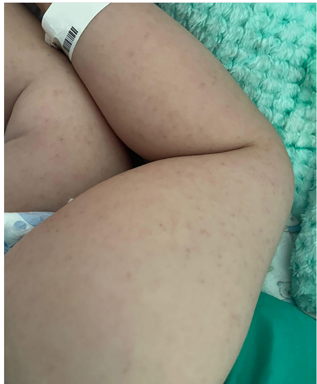
Figure 2 - Petechial rash on the limbs.

The fever stopped after the third day of treatment, however, due to the neurological symptom persistence, the patient was transferred to a reference hospital in the state capital, for continuity of care. On admission, nine