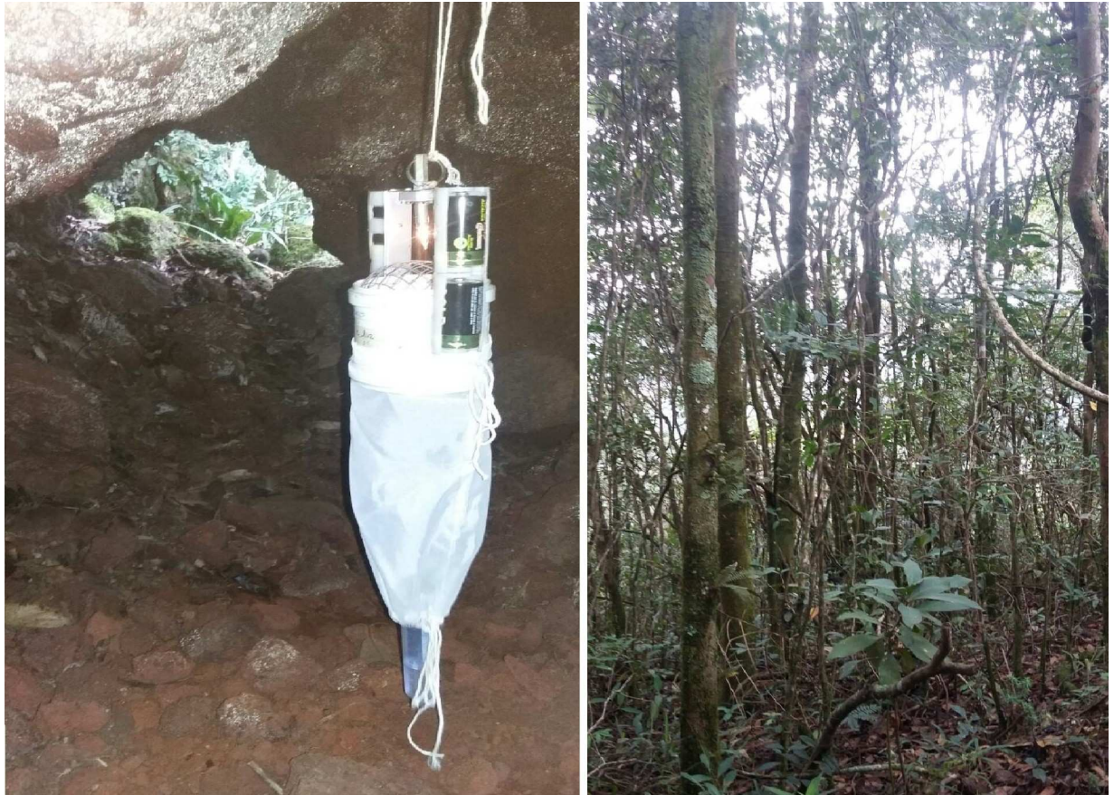
Fig 3. Cave RM38 and its surroundings in Parque Estadual Serra do Rola Moça (PESRM), Minas Gerais, Brazil.

https://doi.org/10.1371/journal.pone.0220268.g003