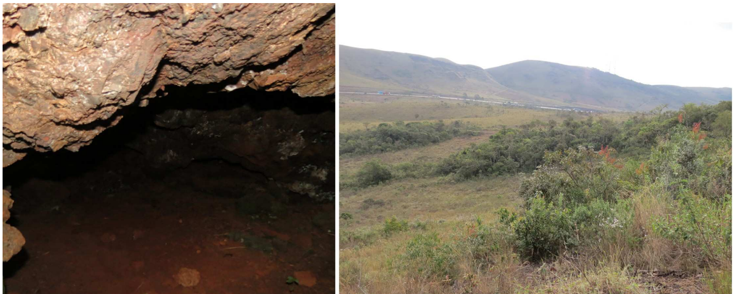
Fig 2. Cave MS and its surroundings in Moeda Sul (MS), Minas Gerais, Brazil.

Systematic collections were performed using HP-model automatic light traps [29], throughout an entire year: April 2014 to March 2015 at MS, and February 2014 to January 2015 at