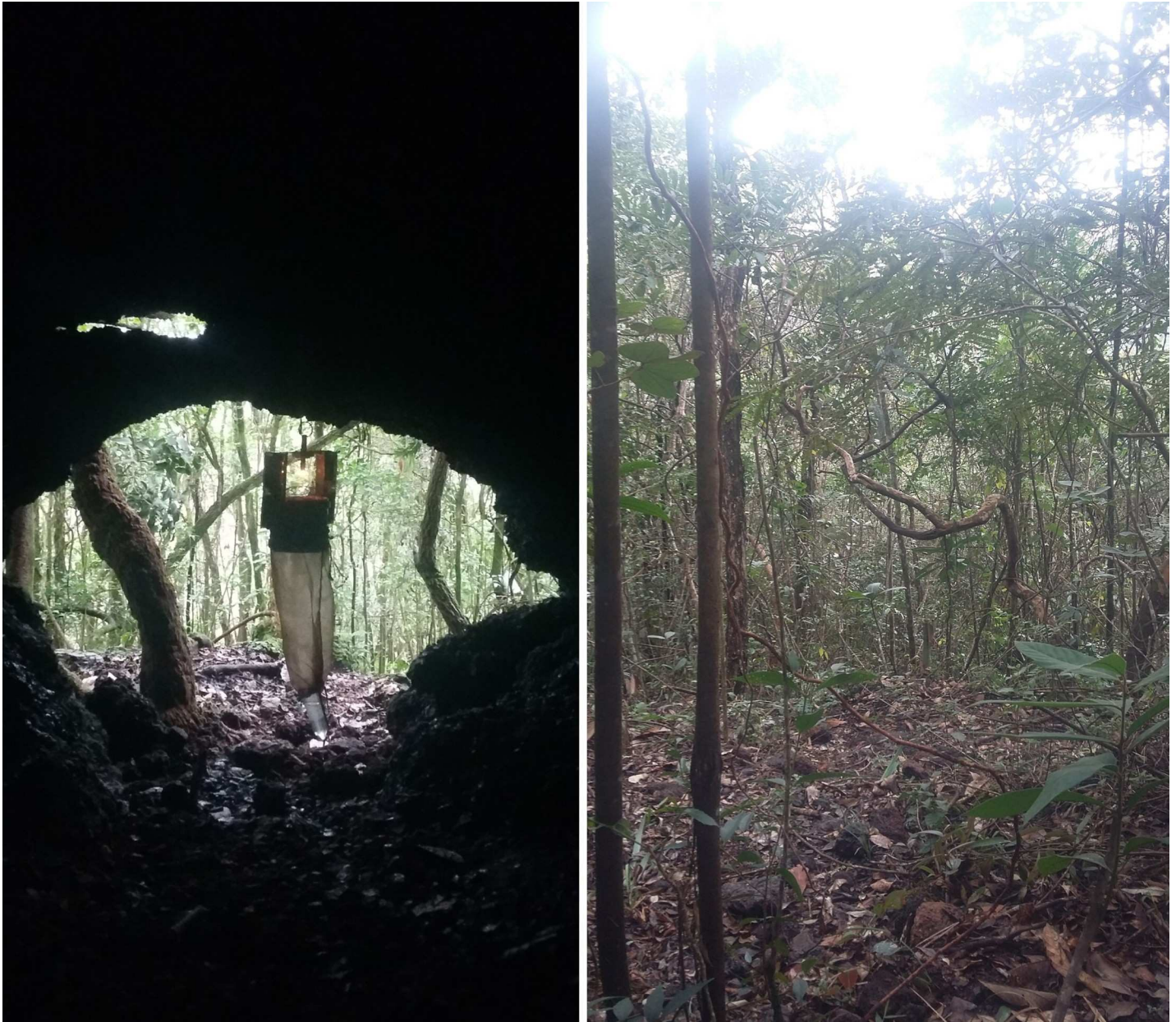
Fig 4. Cave RM39 and its surroundings in Parque Estadual Serra do Rola Moça (PESRM), Minas Gerais, Brazil.

https://doi.org/10.1371/journal.pone.0220268.g004