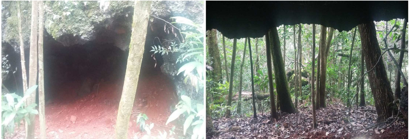
Fig 5. Cave RM40 and its surroundings in Parque Estadual Serra do Rola Moça (PESRM), Minas Gerais, Brazil.

https://doi.org/10.1371/journal.pone.0220268.g005