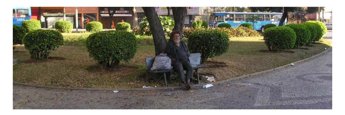
Figure 1: A marginalized user watching the passing scene in Raul Soares Square.

However, although undesirables are not likely to carry out optional stationary activities in central urban squares in the context of Belo Horizonte, at least during weekdays at lunch time, statistical analysis revealed that undesirables were more likely to perform optional stationary activities in Raul Soares Square. During the fieldwork activities, Raul Soares Square was comparatively a very badly-maintained urban square (Figure 1).