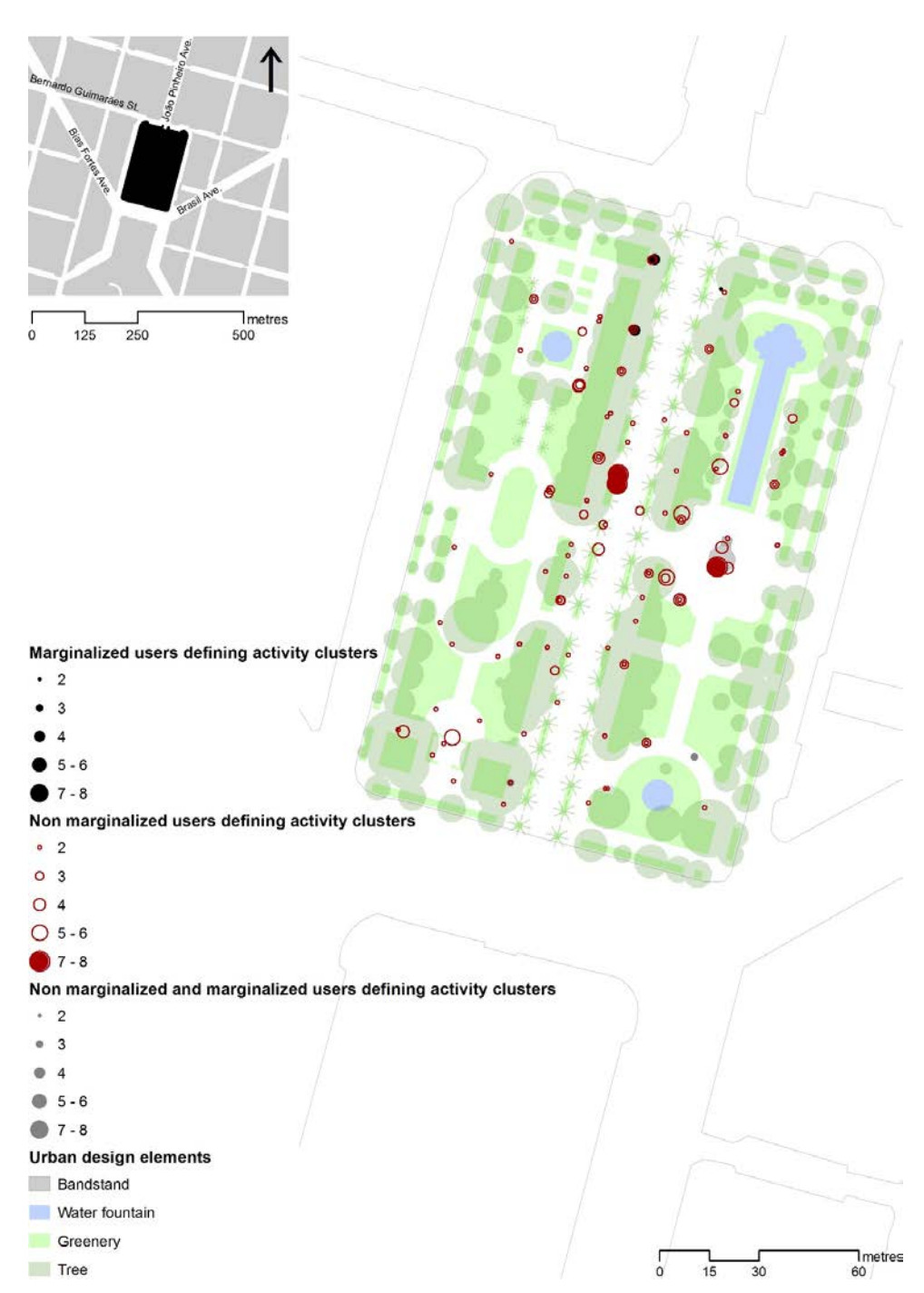
Figure 3: Behavioural map showing activity clusters in Liberdade Square.