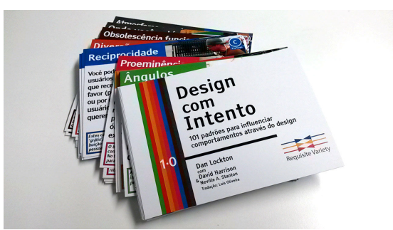
Figure 2 - Design with Intent Cards (LOCKTON; HARRISON; STANTON, 2010), translated to Portuguese

The creativity workshop was instigated by the use of the Design with Intent Cards (LOCKTON; HARRISON; STANTON, 2010), translated to Portuguese, available online<sup>1</sup>. The content used during this workshop was produced exclusively to this purpose and kept freely available. For most of the material, this was the first time they were published in Portuguese, which benefited the students and broader community.