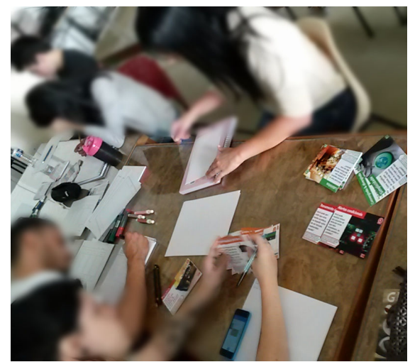
Figure 3 - Workshop setting