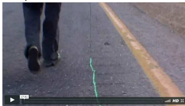
Fig. 4. The Green Line , Francis Alÿs. Jerusalem 2004. (Source: artist's website. Available in: http://francisalys.com/the-green-line/ . Accessed 22 Feb 2017)

drawn by a military commander, using a green pencil on a map (Harmon & Clemans 2009), and it separated some disputed Palestinian territories in the West Bank. This demarcation had an extensive impact in local population. From both sides, their lives were affected by administrative, cultural, religious and security issues. Although that demarcation line was officially removed some decades later, its effects are still present. Since then, the line became a clear example of how an artificial decision on a map could impose power relations over a territory.