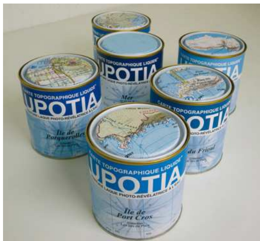
Fig. 2. Upotia: les îles de PACA, Nicolas Desplats. Mappamundi exposition, Hôtel des arts, Toulon, France, 2013.

The third example comes from Francis Alÿs, a Belgian artist that proposed performances in two of the most controversial borders worldwide: the US-Mexico border and the Green Line in Israel. In 1997, Alÿs was invited to join the InSite exhibition held in the San Diego-Tijuana border region. For this exhibition, Alÿs prepared a performance called The Loop : his purpose was to travel from Tijuana to San Diego without crossing the US-Mexico border. In order to accomplish this long and expensive journey, Alÿs did a circumnavigation around the Pacific Ocean (figure 3). His itinerary comprised the following cities: Tijuana, Mexico City, Panama City, Santiago, Auckland, Sydney, Singapore, Bangkok, Rangoon, Hong Kong, Shanghai, Seoul, Anchorage, Vancouver, Los Angeles, and finally San Diego. With this performance - an extravagant and wasteful trip - Alÿs criticizes the economic and political obstacles that Mexicans are facing. Therefore, crossing that border is privilege that is allowed only for few people.