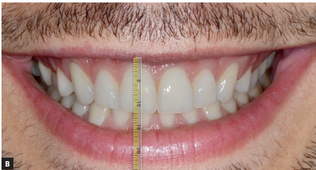
Figure 3 - A) Keynote mask; B) Maxillary right central incisor with increase of 1mm performed with Keynote mask.