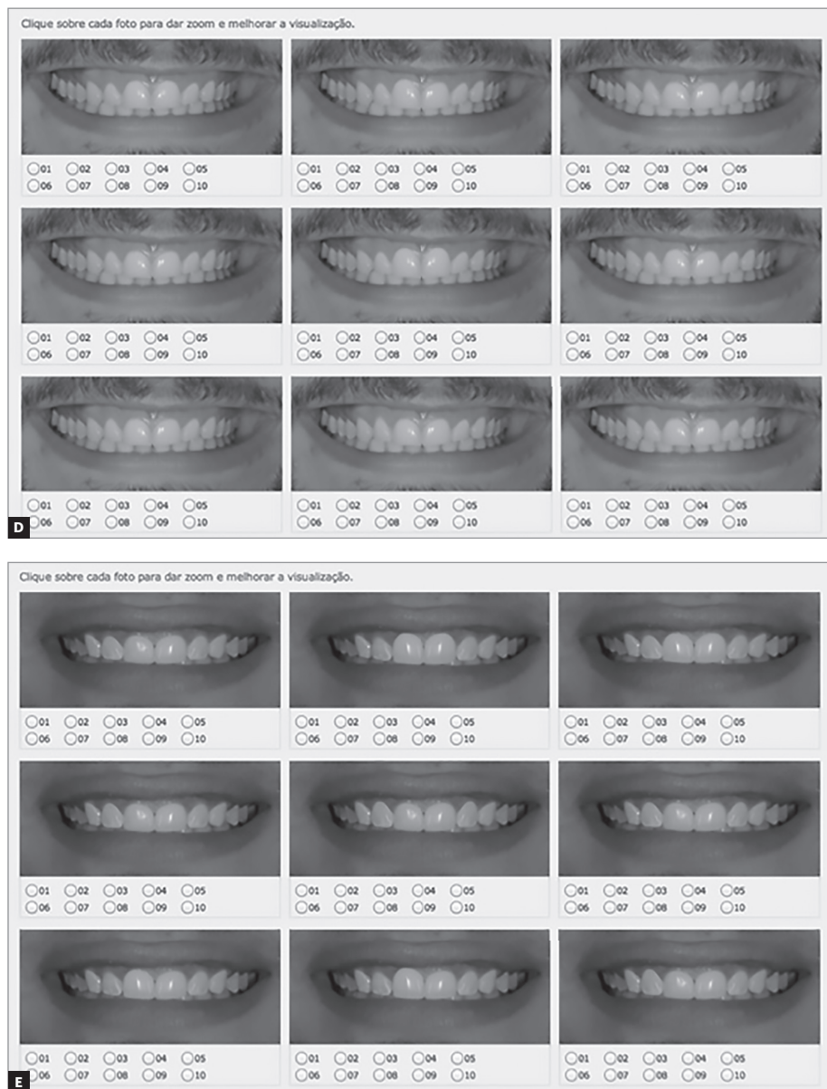
Figure 6 - Altered gingival zeniths: A) patient 1, B) patient 2, C) patient 3, D) patient 4, E) patient 5.