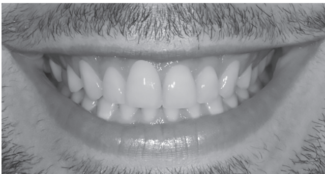
Figure 4 - Final manipulated black and white photo.

layperson was defined as a subject with no formal education in dentistry or dental hygiene, however, but studying or already finished high school, with minimal age of 17 years and maximum age of 75 years. General dentists should be graduated in Dentistry and could have or not a specialization in any Dentistry area, except Orthodontics. Orthodontists raters were considered as a general dentist that already had finished their specialization, master degree or PhD in Orthodontics. 10 Each rater received the links to access the internet website where they could access and evaluate the photos.