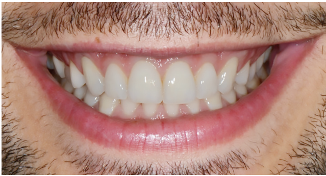
Figure 2 - Ideal smile.