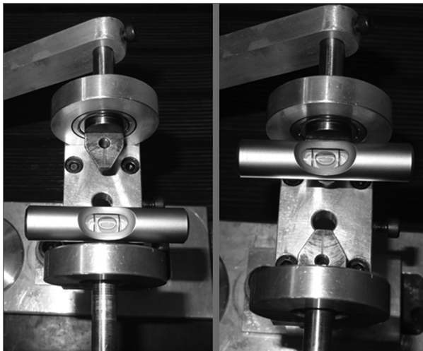
Fig. 2: "Bubble Level" accessory to leveling the system in each start test.

the force moment was measured in "Nmm" (Newton x mm) and then converted to an angle number.