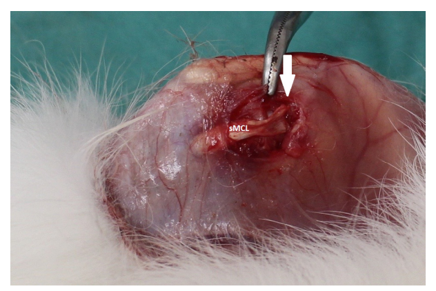
Figure 2 - Lesion in the femoral insertion of medial collateral ligament. sMCL : superficial medial collateral ligament; Arrow : rupture in mop-end lesion.

Figure 1 - Hemostat positioned under medial collateral ligament to rupture the ligament in tip swab. Patela : patella bone; H : hemostat; sMCL : superficial medial collateral ligament.