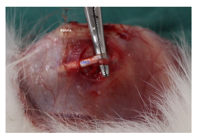
Figure 1 - Hemostat positioned under medial collateral ligament to rupture the ligament in tip swab. Patela : patella bone; H : hemostat; sMCL : superficial medial collateral ligament.