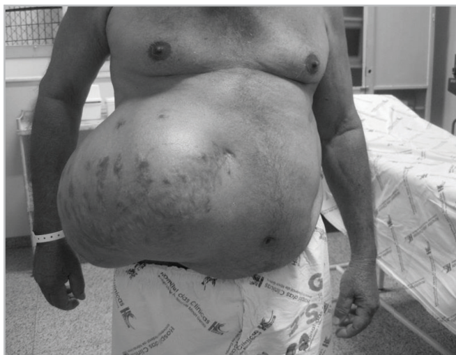
Figure 1. Patient presented with a giant right subcostal incisional hernia at admission.

Three days later, he underwent surgery for hernia repair, the pneumoperitoneum was removed and the hernia was reduced, resulting in a good outcome (Figure 3).