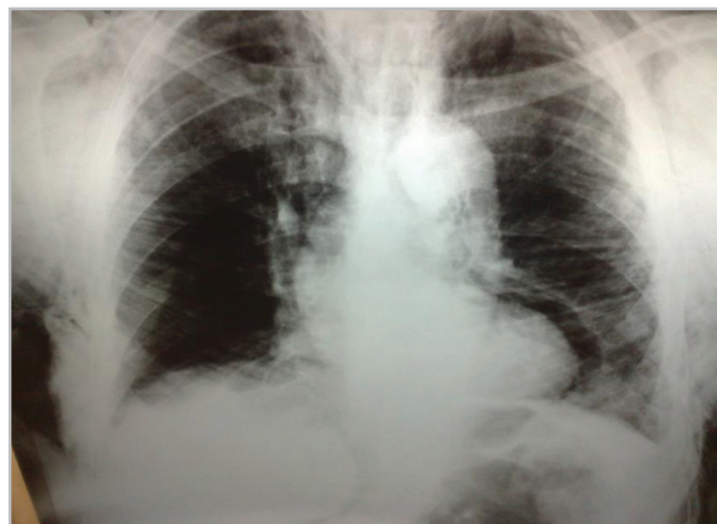
Figure 2. Chest x-ray revealed pneumomediastinum and subcutaneous emphysema which also dissected thoracic musculature. No signs of pneumothorax were seen.