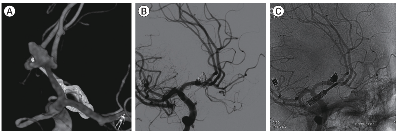
Fig. 1. (A) 3D rotational angiography showing a residual anterior communicating artery aneurysm after clipping. (B) Control angiography after stent-assisted coiling. (C) Note the laser-cut stent deployed from A1 to contralateral A2.

The operative data included treated aneurysm, presence of angiographic vasospasm in ruptured aneurysms, type of EVT, technical complications, and immediate