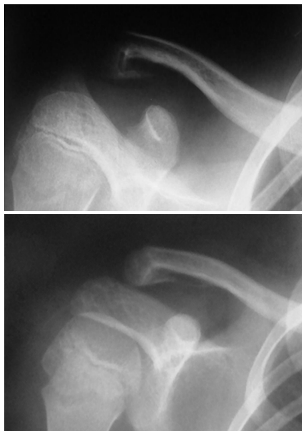
Fig. 2 – Conservative treatment of distal fractures of the clavicle.

All the patients were treated in our hospital. Conservative treatment was used in nine patients: three in group IIIb; three in IIb; two in IIa; and one in IV (Fig. 2). The only patient who was treated surgically was an 11-year-old female patient who