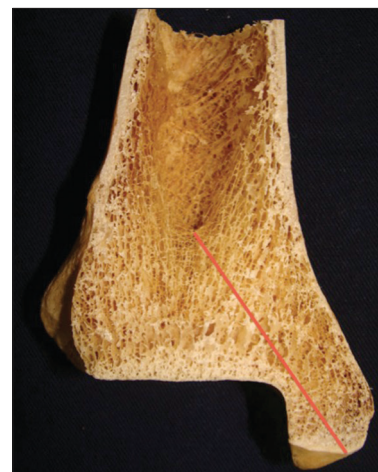
Figure 1: Coronal cut. Red line: Distance between the medial malleolus tip and the medullary canal

Excessively long partially threaded screws can bypass the good cancellous bone in the metaphyseal area and lead to inefficient compression due to poor screw thread purchase inside the medullary canal. An excessively short screw can endanger fracture compression due to screw threads not completely bypassing the fracture site. The present study showed an average distance of 55 mm (SD: 10 mm) between the medial malleolus tip and the start of the medullary canal in 116 Latin American cadavers, with a 10 mm SD. Therefore, when using a typical partially threaded screw (roughly 16 mm of thread length), one can conclude that the ideal screw length is roughly 45 mm for placement of the screw threads in the optimal cancellous bone to generate effective fracture site compression.