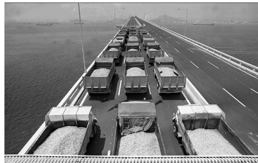
Figure 1. Proof Load Test on Rio-Niterói Bridge.

Formerly bridge monitoring and testing were characterized by observation process of structural behavior, techniques conceptions and appropriate equipments. At this time, calculus methods were reduced, being common the use of simplified models for complex structures analysis. With these conditions, the information obtained through monitoring was more relevant for safety verification [4].