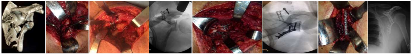
Figure 1: Complex scapula fracture involving the glenohumeral joint. Note the small 2.3-mm mini plates used as reduction plating, which eliminated the need to maintain the K-wires in place.

the periosteal attachment during the introduction of K-wires [1, 2, 3, 4].