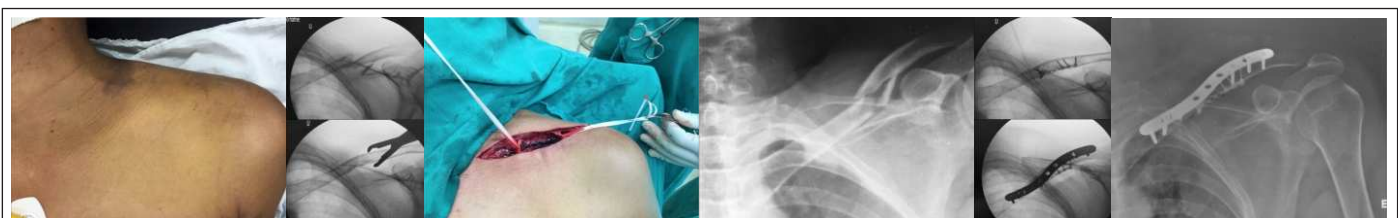
Figure 2: Mid-shaft complex clavicle fracture with a volar third fragment. Note the inferior 2.3 mm mini plate used as reduction plating. A second definitive small fragment pre-contoured anatomical locked plate was applied to the dorsal aspect of this bone, assuring rigid fixation of the fracture.

• Patient 3 - Distal humerus fracture: A 51-year-old female housewife presented with a complex 13-C3 type fracture, with coronal extension to the capitellum. She reported to fall down a stair in her house 1 day before she presented to the hospital. We decided to approach this injury with the patient in prone position and the elbow flexed at 90°. After beginning with a universal Campbell approach, the ulnar nerve was identified and protected. Then, we performed an extra-articular osteotomy of the tip of the olecranon to expose the fracture fragments. We began by directly manipulating the coronal