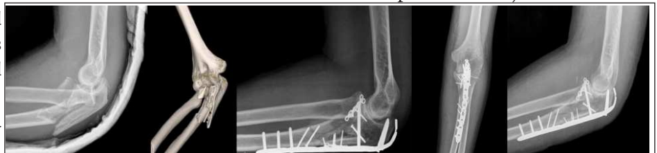
Figure 4: Complex multifragmentary proximal ulna fracture with olecranon and coronoid involvement. In this patient, two 2.3-mm mini plates were used as reduction plating.

Functional restoration of the operated joints and segments was achieved in a period of 6 months post-operative for the scapula fracture and 9 months for periarticular injuries of the elbow,