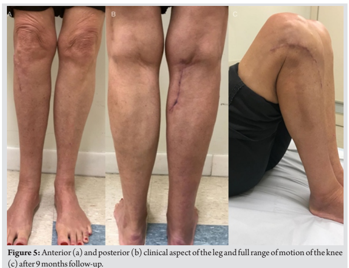
Figure 5: Anterior (a) and posterior (b) clinical aspect of the leg and full range of motion of the knee (c) after 9 months follow-up.