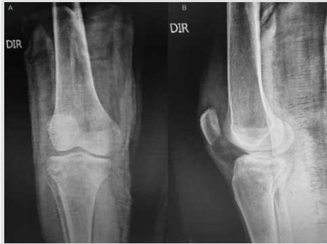
Figure 1: X-ray in anteroposterior (a) and lateral (b) views showing a bicondylar tibial plateau fracture (Schatzker V).