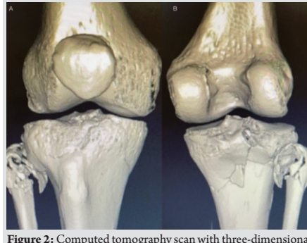
Figure 2: Computed tomography scan with three-dimensional reconstruction (a and b) showing the bicondylar tibial plateau fracture. Note the posterior column impairment.