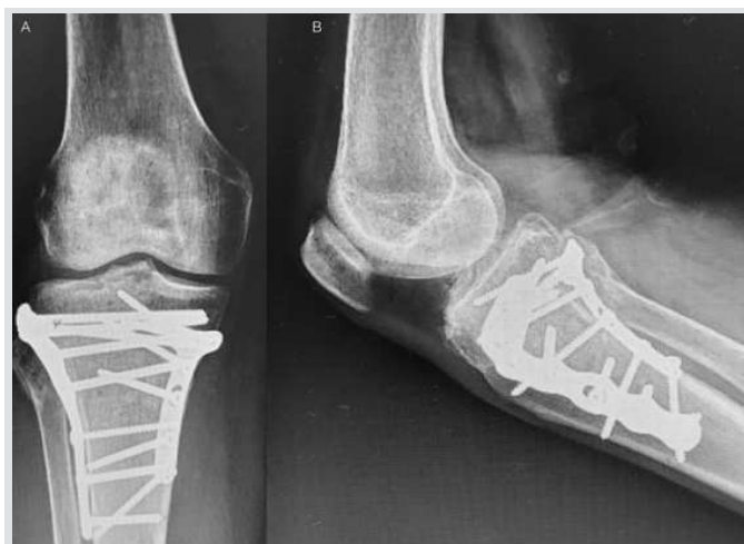
Figure 4: X-ray in anteroposterior (a) and lateral (b) views showing fracture fixation with a posteromedial buttress plate and precontoured anterolateral locked plate.

Calf augmentation is an infrequent cosmetic procedure aiming to improve leg contour in patients with thin legs or when a defect is present due to injury or illness (poliomyelitis, clubfoot,