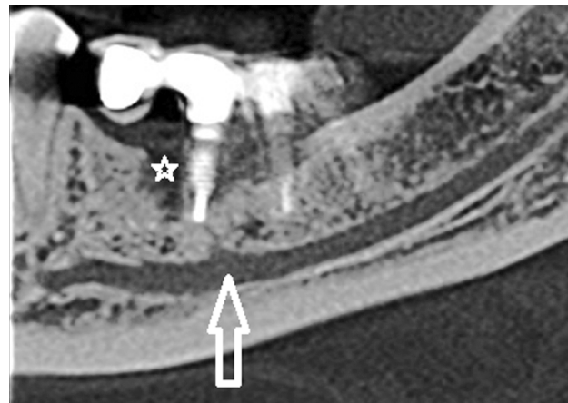
Fig 3. Double, superior and apical mandibular canal branch (white arrow) toward perimplantitis (white star).