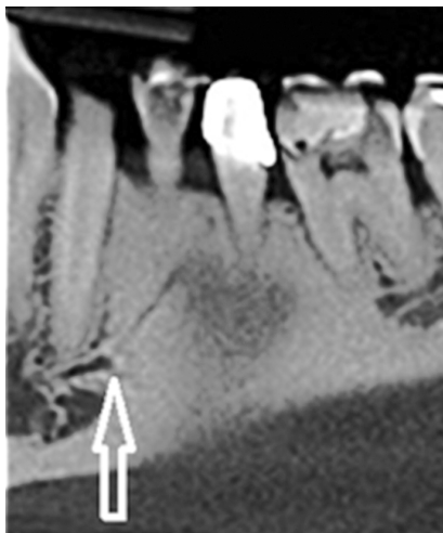
Fig. 2. Single, posterior and cervical mandibular canal branch (white arrow) toward horizontal bone loss.