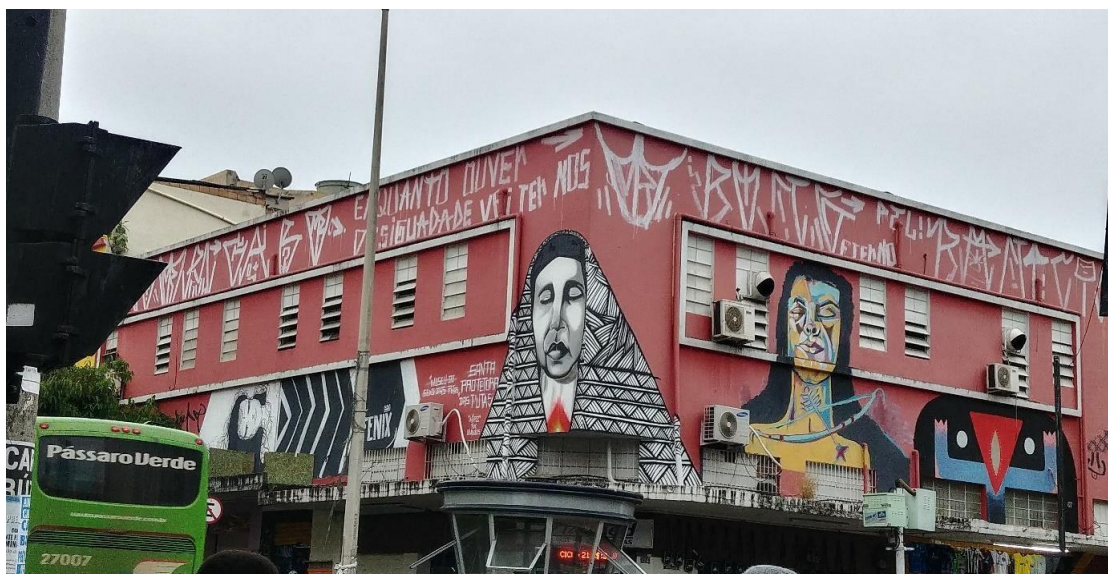
Figura 2. Paradoxicalities of Guaicurus

However, the region is permeated by several complex and paradoxical issues in the Brazilian socio-historical-cultural context, for sacred images divide the space with sexual and political references, among others (Figure 2).