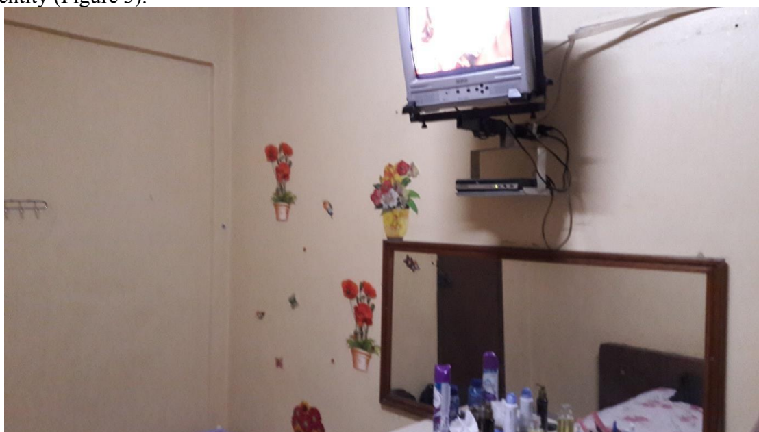
Figura 3. Mitigating the pains of a loathsome place

Inside the rooms, the power relationship seems to be reversed and the women become the dominant figure. Upon entering there, we identify a process of spatial-temporal reterritorialization, for the dominated temporarily assume the role of dominant, even if in a contradictory way, as they must serve their female bodies to male pleasure. Therein, the place can be fragmented so that each part is redefined and assumes a new identity (Figure 3).