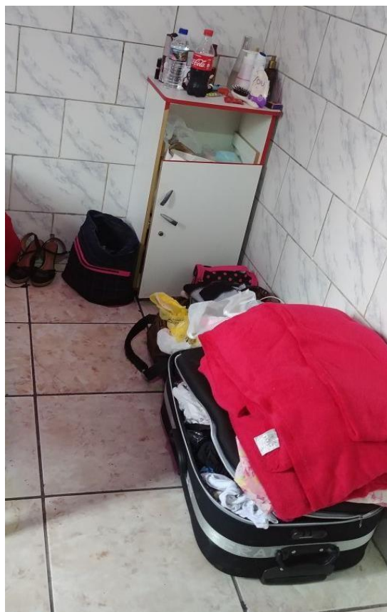
Figura 5. The untouchable space

We also highlight the presence of “untouchable spaces” in the brothels that we visited. Most interviewees have a specific resignified place in their rooms, whose representation goes beyond their spatial limits. The prostitutes’ personal belongings are charged with affective and symbolic values, such as the space of penance and prayer, the image of the patron saint at the door, the table with pictures of their children, the bedside book, among others (Figure 5).