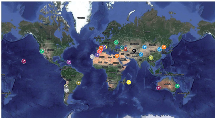
Figure 1. World map showing the current distribution of GRANDMA observing facilities, not including the Kilonova-Catcher amateur telescopes.

Together, the different GRANDMA facilities provide large amounts of observing time that can be allocated for photometric and/or spectroscopic follow-up of transients. The network has access to wide field-of-view telescopes (FoV > 1 deg 2 ) located on three continents, and remote and robotic telescopes with narrower fields-of-view.