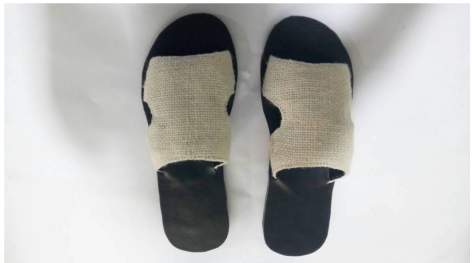
Fig 2. A pair of transfluthrin-treated sandals.

Observations were done for six hours starting either early morning (for day-biting Ae. aegypti ; 06:00am to 12:00 noon) or early evening (for night-biting An. arabiensis ; 06:00pm to 12:00 mid-night). During each experimental replicate, 100 sugar-starved female mosquitoes