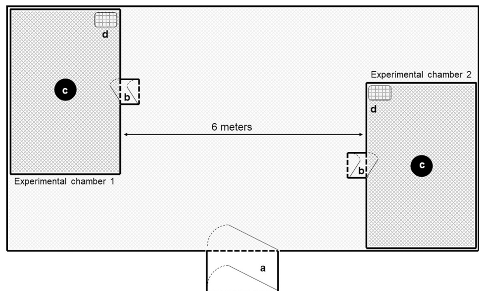
Fig 1. Illustration of the experimental chambers inside the semi-field facility, showing: a) Entry into the main chamber; b) Entries into the experimental cages; c) Volunteer stations and d) Mosquito release points.

Laboratory-reared nulliparous 4–9 days old An. arabiensis , and Ae. aegypti mosquitoes, starved for six hours prior to experimentation, were used. These infection-free mosquito colonies were maintained using standard procedures as previously described [23, 24].