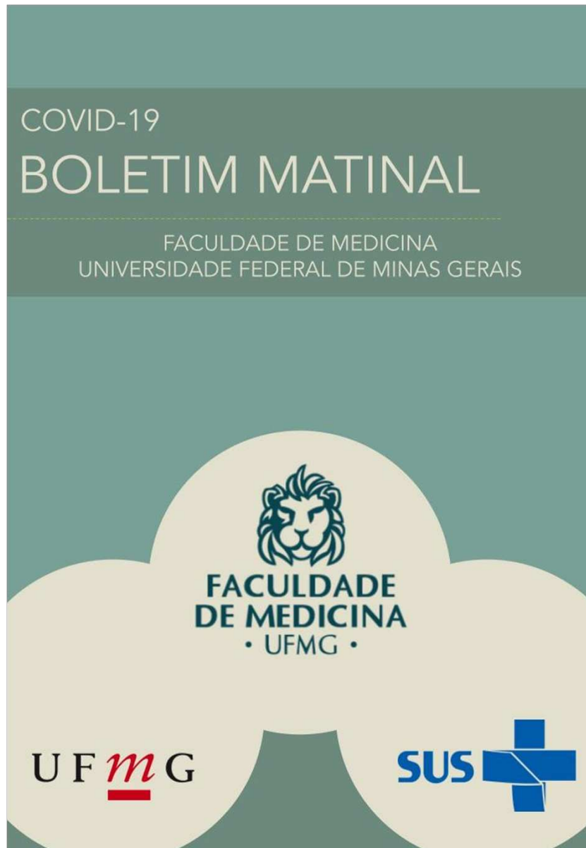
Figure 1 - Morning Bulletin cover image

The objective was to produce, initially, daily, a newsletter containing summaries of recent scientific articles, updated epidemiological data, and news from Brazil and the world and to disseminate it on social networks. The content is selected by professors and summarized by medical students participating in the project. The language is accessible and the texts are succinctly prepared so that reading is easy, and fast and provides relevant information for the lay public and