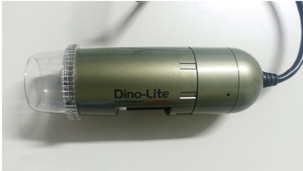
Figure 1- Dino-LiteAM4113ZT dermatoscope which features 1.3 Mega Pixel resolution and USB 2.0 interface.

the skin of the contact and a record of the Mitsuda test reaction was made by means of the software Dermatologia web (Figure 2).