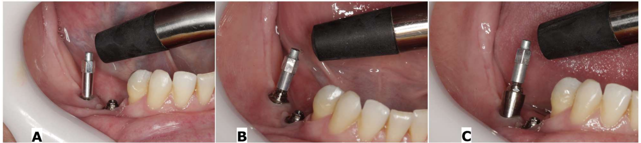
Fig 1. Resonance frequency analysis by Osstell. A) Implant platform B) 1mm microunit C) 5mm microunit.

https://doi.org/10.1371/journal.pone.0181873.g001