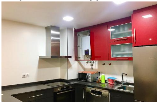
Fig.4: Recent dwelling kitchen with safe equipment.

considerable in people's way of life. An intra-wall social gain that expands to society, as the building being properly cared for and with safe equipment (Fig. 4) and the neighborhood being valued will prevent the loss of cultural identity of cities (LANZINHA, 2014), improving the perception of security, diminishing areas of crime scene in many cities due to the abandonment of central areas by municipal administrators and the population itself.