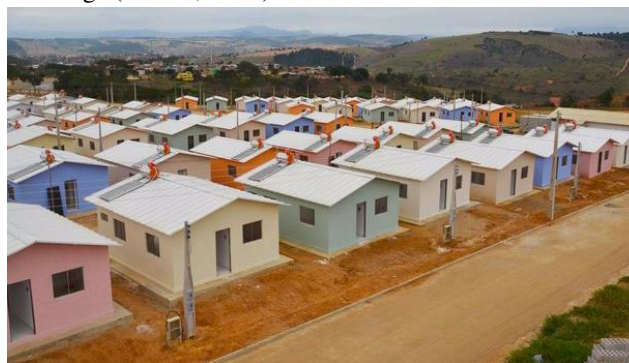
Fig.2: My House My Life Program.

Noting the need for the quality of buildings, especially the construction and housing characteristics, ISO 6241 (1984), being the first international standard for building performance, was a basis for other standards from other countries, such as the Brazilian Association of Technical Standards, that launched in 2013 the Norm 15575, about Housing Buildings Performance, covering seven user requirements, namely: water tightness; thermal performance; acoustic performance; light performance; health, hygiene and air quality; functionality and accessibility; and tactile and anthropodynamic comfort of buildings (ABNT, 2013).