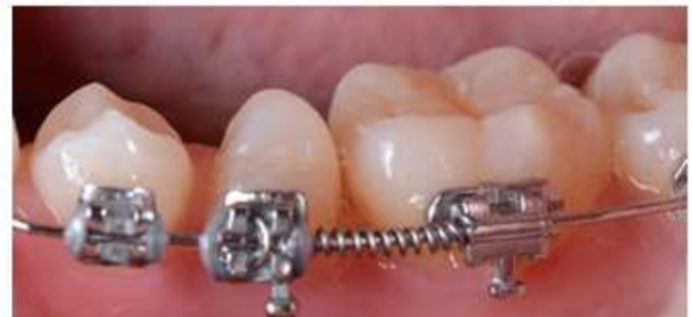
Figure 2: Segmented arch mechanics.

Edgewise, slot 0.022"x0.025") from tooth 33 to tooth 37. A 0.020" stainless steel wire was passively inserted into teeth 33, 34, 36, and 37 for anchoring orthodontic tooth movement. For lingualization of tooth 35, a first-order fold (in set) was performed, and for mesialization, a nickel-titanium open-coil spring was used between teeth 35 and 36 (Figure 2).