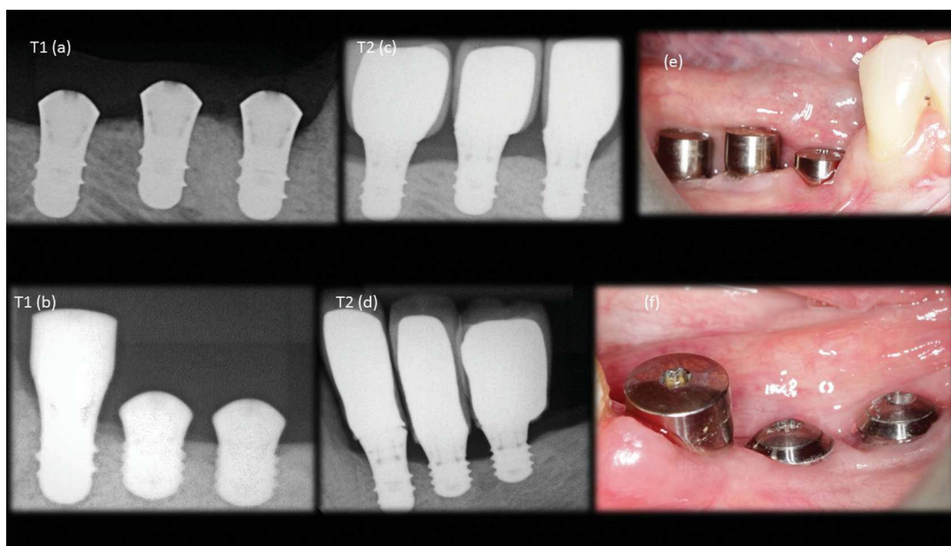
Fig. 1: a,b) immediate x-ray of the implants installed; c,d) radiograph after one year of masticatory function; e,f) clinical photography.

After the implants were installed, a periapical radiograph, with parallelism technique, was performed for each implants (T1) and this process was repeated with a minimum period of 1 year in masticatory function (T2), in order to evaluate the marginal bone stability (Fig. 1). The measurements of the mesial and distal bone crestal regions of each implant were selected, from the bone crest to the region parallel to the apex of the implant. The measurements of these crests were based on the original size of the implants for calibration. Analyses were performed independently for the mesial bone crest and distal bone crest (Fig. 2).