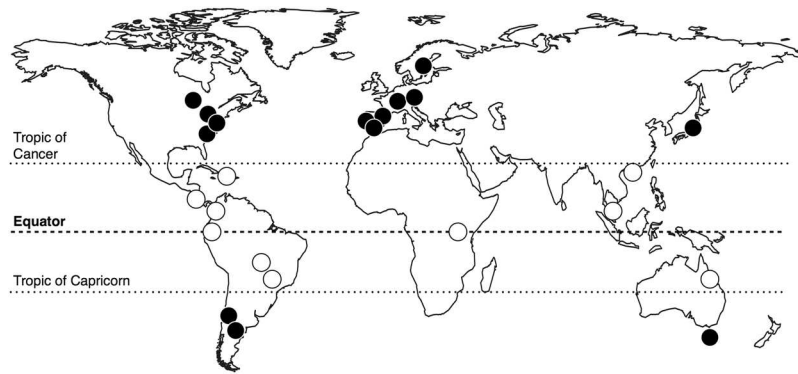
Figure 3. Location of 24 riparian litter collection sites; open and closed circles represent tropical and non-tropical regions, respectively. The map was created in the maps R package (Original S code by Richard A. Becker, Allan R. Wilks. R version by Ray Brownrigg. Enhancements by Thomas P Minka and Alex Deckmyn. (2016). maps: Draw Geographical Maps. R package version 3.1.1. https://CRAN.R-project.org/package=maps ).

Scientific Inc., Waltham, MA, USA). To determine P concentration, we acidified the remaining 20-mL aliquot with 1 mL of concentrated HCl, added deionized water for a final volume of 100 mL, and filtered the resulting solution through a Whatman GF/C filter (Whatman, Maidstone, UK). P was determined on the filtrate by the molybdate-blue method, and absorbance was measured at 880 nm on a Jenway 6715 UV/Vis spectrophotometer 58 . Additional leaves were rehydrated and ten 12-mm diameter discs were cut with a cork borer; the discs were then oven-dried at 45 °C for 48 h and weighed to determine SLA as the ratio of disc area (cm 2 ) to leaf dry mass (mg).