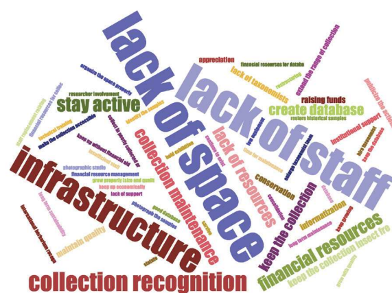
Figure 3. Word cloud generated based on the question “What is the biggest challenge in the collection?”. The data were tabulated, standardized and the word size reflects the number of times it was cited.