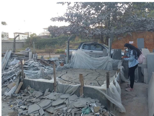
Figure 1. Waste reservoir of the marble shop where the sample studied was collected.

The samples consist of fine (2–0.075 mm) and ultrafine (< 0.075 mm) waste generated in the cutting and polishing phase of various ornamental rocks, including mainly marbles, granite, gneiss, and gabbro, collected in a marble shop located at João Monlevade, Minas Gerais state. The mud results from the cutting and polishing phase; it is decanted, and the solid material is deposited in a temporary reservoir (Figure 1). When this reservoir is full, the marble shop hires a company for a final disposal of the material. The reservoir has about 2.3 meters of length and width, and is 50 centimeters thick, resulting in a storage of 2.645 m 3 . Three samples were collected making a vertical hole along the 50 cm thick, using a round handle articulated digger.