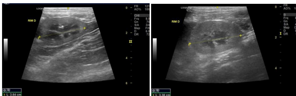
Figure 1 (A and B), Abdominal ultrasound of animal 8 in initial (A) and the final time (B) of dox based protocol, presenting slight loss of renal cortical-medullary definition, associated with a slight increase in the echogenicity of the cortical region, suggesting the onset of nephropathy. Ultrasound device: GE R7-Logiq E Veterinary.

In the initial time, all the cats had kidneys with normal appearance and size at abdominal ultrasound. At the final time (two months after the end of treatment), the four cats who completed the therapeutic protocol (1,6,7 and 8), underwent a new abdominal ultrasound. Three of them (animals 1, 6 and 7) did not show changes in kidney topography. The older cat (animal 8), presented a slight loss of renal cortical-medullary definition, associated with a slight increase in the echogenicity of the cortical region (Figures 1 A and B).