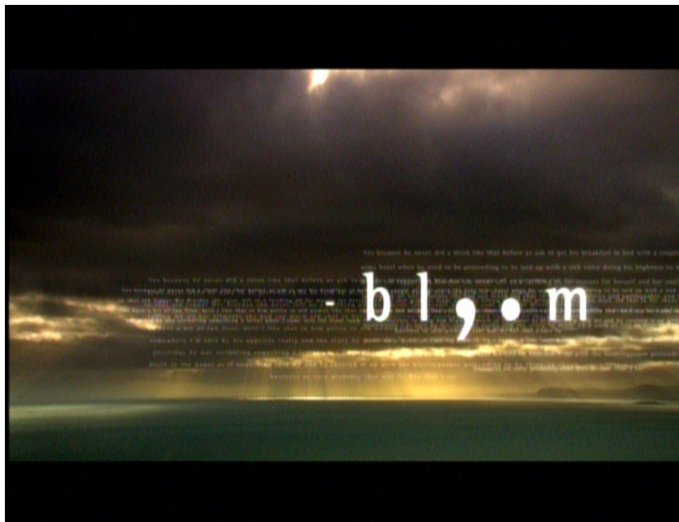
Fig. 2. Sean Walsh, Bloom (São Paulo, 2004) DVD.