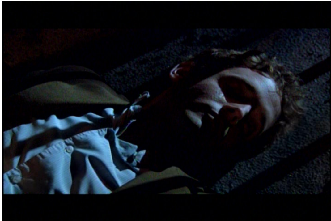
Fig. 8. Sean Walsh, Bloom (São Paulo, 2003) DVD, Chapter thirteen.

The filmmaker uses a high angle of framing, indicating the relation between Rudy and the camera's point of view. So, Rudy is looking at Leopold in this snapshot, in a vulnerable condition which emphasizes Rudy's dependence and smallness compared to his father, Bloom. Besides this angle, the height of the camera is also a significant element in film. In this case, the camera is placed above the typical perspective, emphasizing the superiority of Bloom in relation to Stephen.