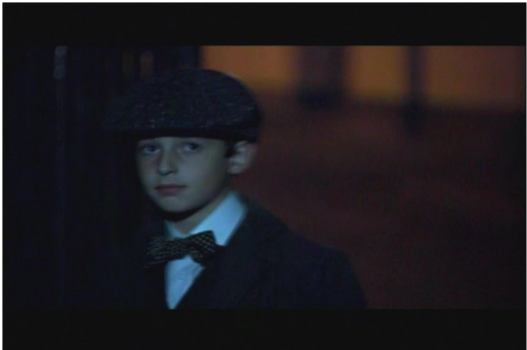
Fig. 7. Sean Walsh, Bloom (São Paulo, 2003) DVD, Chapter thirteen.

The following snapshots illustrate the scene described: the first depicts Rudy and the second, Stephen.