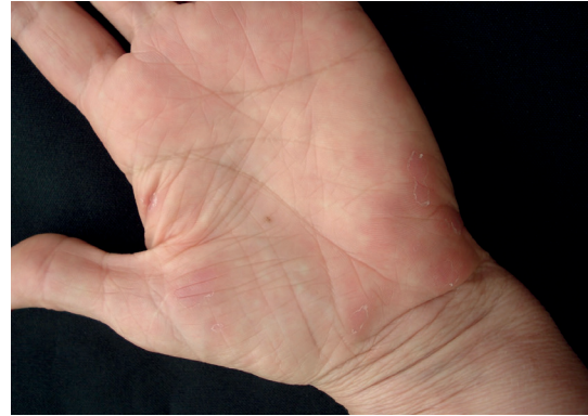
FIGURE 2: Slightly scaly erythematous plaques on the palm of the left hand

A 59-year-old woman was referred to the Dermatology Service for evaluation of lesions on her hands and feet, which had appeared over the past 20 days and were asymptomatic. Her previous medical history included malignant neoplasia of the intestine, treated three years earlier, and essential arterial hypertension. She reported the use of enalapril, calcitriol and calcium carbonate, and denied allergy to any medication previously taken. A physical exam revealed slightly scaly erythematous plaques on her palms and soles (Figures 1 to 3). A skin biopsy revealed acantosis, hypergranulosis and compact orthokeratosis in the epidermis, while a lymphohistiocytic interstitial infiltrate, with an outline of epithelioid granulomas, was identified in the dermis, permeating areas of partial degeneration of collagen fibers, coupled with a few multinucleated giant cells engulfing degenerated elastic fibers (Figure 4). There were no specific microorganisms in the sample. The lesions partially regressed after the biopsy and the remaining lesions were treated with high-potency topical corticosteroid, under occlusion, for seven days.