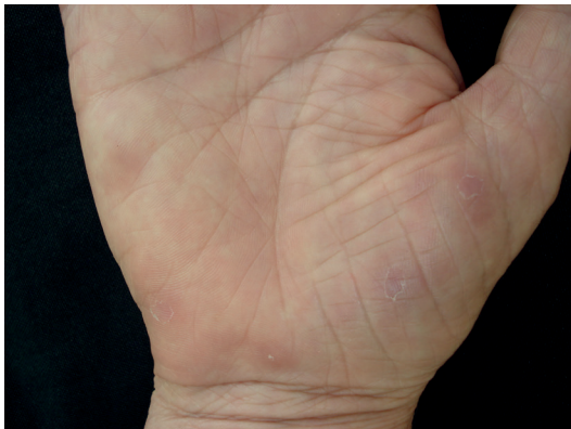
FIGURE 1: Slightly scaly erythematous plaques on the palm of the right hand